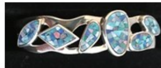
Opal and Sterling Silver Bracelet

3/4 of an inch in width ~ it's an open cuff so will fit any wrist