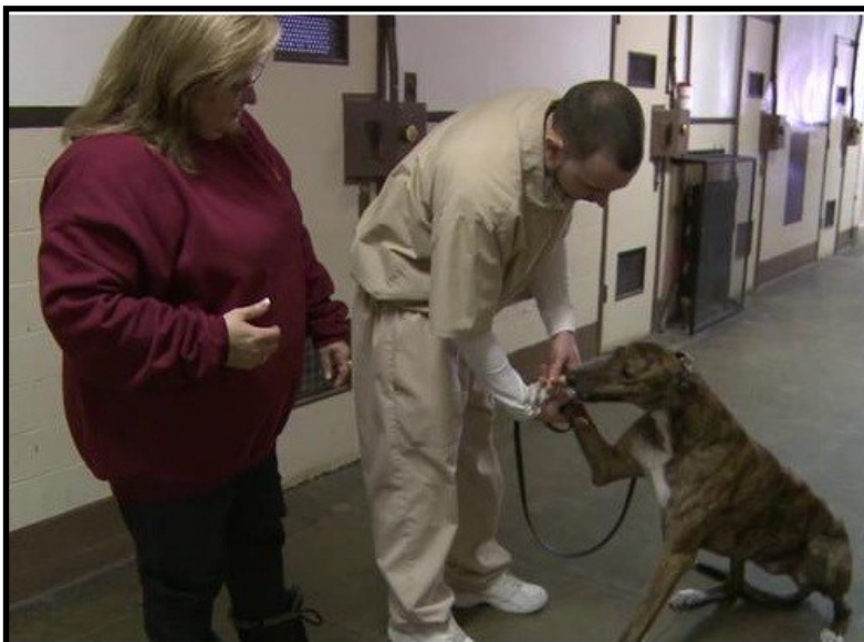
Photos from the Prison Foster Program.