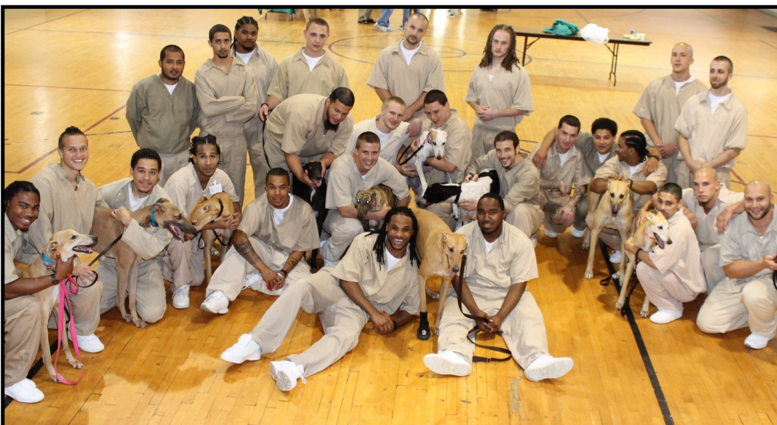
Inmates and greyhounds from the Prison Foster Program.

When a skunk is preparing to spray, it will arch its back, raise his tail high, and begin hissing and stomping his feet on the ground. He may even do headstands with his back and tail arched towards the intruder. When he actually sprays, he will bend into a U-shape, with his head and back end facing the intruder, and let 'er rip, aiming his spray primarily at the intruder's face.