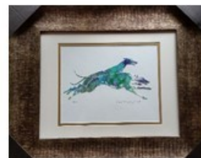
"Friends of the Wind" By Josie Therapy Dog 8" x 10" and framed to 16" x 19"

3/4 of an inch in width ~ it's an open cuff so will fit any wrist