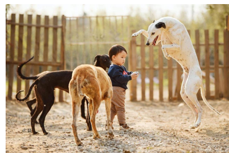
China dog Ellie (White)